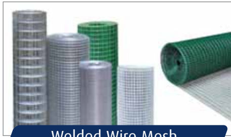
Welded Wire Mesh