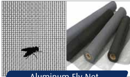
Aluminum Fly Net